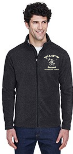
Fleece Jacket $56 S — 5XL

Black, Burgundy, Gold, Purple, Navy, Red, Forest, Charcoal, Royal