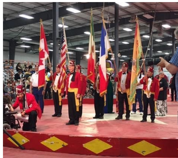
Final circus in Winnipeg