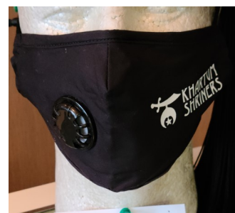
Khartum Shrine Mask $15 Black

Black, Forest, Graphite, Kelly Green, Lilac, Navy, Orange, Royal, Scarlet Red LADIES: Graphite, Kelly Green, Navy, Orange, Royal, Scarlet Red