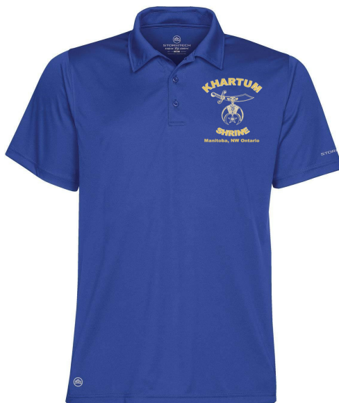
Performance Polo $42 S — 5XL

Black, Burgundy, Gold, Purple, Navy, Red, Forest, Charcoal, Royal