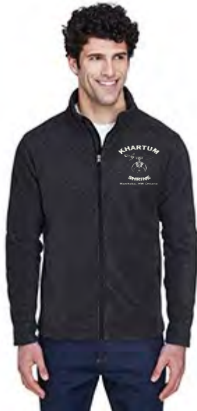
Fleece Jacket $60 S — 5XL Black, Burgundy, Gold, Purple, Navy, Red, Forest, Charcoal, Royal