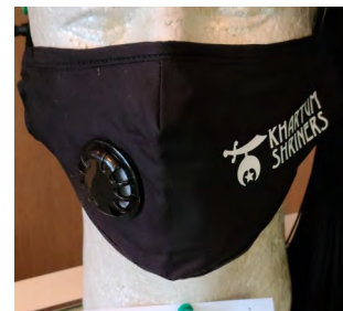
Khartum Shrine Mask $15 Black