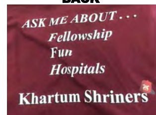
Fez Friday T-Shirt $30 L — 3XL Burgundy