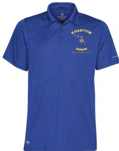
Performance Polo $45 S — 5XL Black, Forest, Graphite, Kelly Green, Lilac, Navy, Orange, Royal, Yellow, White, Scarlet Red LADIES: Black, Graphite, Kelly Green, Navy, Orange, Royal, Scarlet Red, White