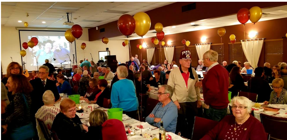
East Coast Kitchen Party

As we roll closer to Christmas, there will be a variety of Christmas parties held by the different units. Have a great time, Nobles and Ladies and we wish you and yours a very merry Christmas.